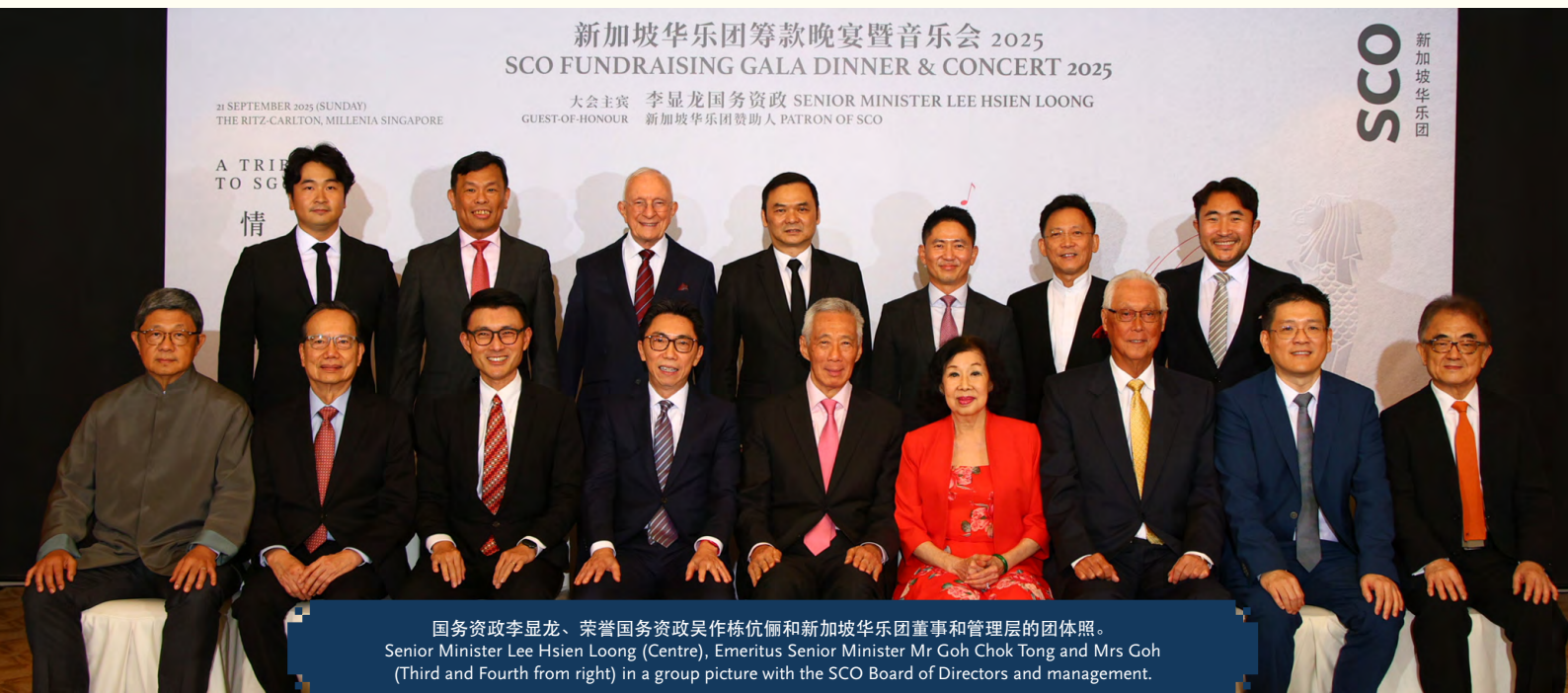
国务资政李显龙、荣誉国务资政吴作栋伉俪和新加坡华乐团董事和管理层的团体照。 Senior Minister Lee Hsien Loong (Centre), Emeritus Senior Minister Mr Goh Chok Tong and Mrs Goh (Third and Fourth from right) in a group picture with the SCO Board of Directors and management.

Singapore Chinese Orchestra raised S$1,226,000 at Fundraising Gala Dinner and Concert 2025: A Tribute to SG60