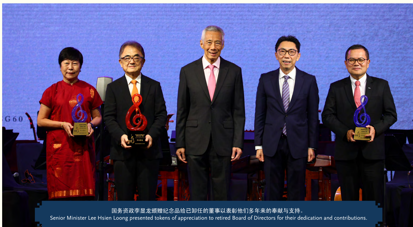
国务资政李显龙颁赠纪念品给已卸任的董事以表彰他们多年来的奉献与支持。 Senior Minister Lee Hsien Loong presented tokens of appreciation to retired Board of Directors for their dedication and contributions.