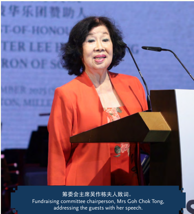
筹委会主席吴作栋夫人致词。 Fundraising committee chairperson, Mrs Goh Chok Tong, addressing the guests with her speech.